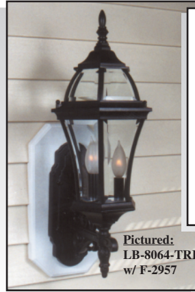
Pictured: LB-8064-TRI w/ F-2957